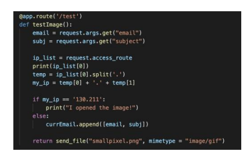
Figure 2. Screenshot of code 1

The system uses the code to the right to create a window that creates the url for the pixel image file. The window utilizes the inputted subject and recipient to create the individual tracking link.