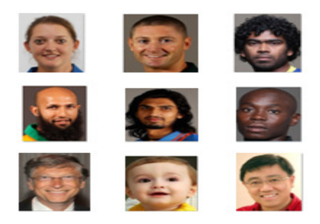
Figure 1.1 Heterogeneous data set

middle aged man or human from different parts(heterogeneous data set) of the world whose face carry few common details compared to human from the same nation(homogeneous data set). Figure 1.1 shows few subjects which are considered for face recognition.