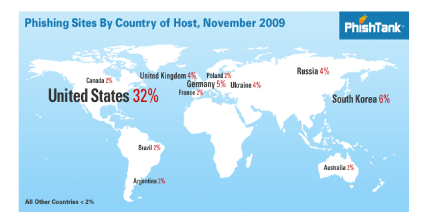
Figure 1: Phishing sites by country of host, November 2009 [2]

Recent statistics show that on an average, 8% tweets contain spam and other malicious content .It has been estimated that in the Kaspersky Lab report 37.3 million users experienced phishing in 2013 [1]. Also, 45 % of bank customers are redirected to a phishing site divulge their personal credentials.