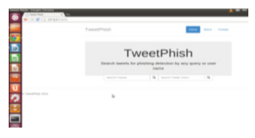
Figure2: Web framework

An addition tab "MORE" is used to load more tweets. It takes some time, to overcome with this limitation, we have used the concept of caching. We can store user requested tweets in cache memory, and checks for the update so that the data in cache memory on client site doesn't become outdated.