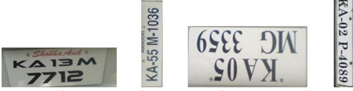
Figure. 1 (a) 0^0 Orientation (b) 90^0 Orientation (c) 180^0 Orientation (d) 270^0 Orientation

efficient automatic reading. The generic OCRs available are designed to read the text in 0^0 orientations and are not capable of reading text in other orientations. The number plates segmented from captured vehicle images may not be in correct orientation i.e number plate instead of being at 0^0 orientation, it may be in any one of the 90^0 , 180^0 and 270^0 orientations. The samples of segmented number plate in different orientation directions are shown in Figure 1.