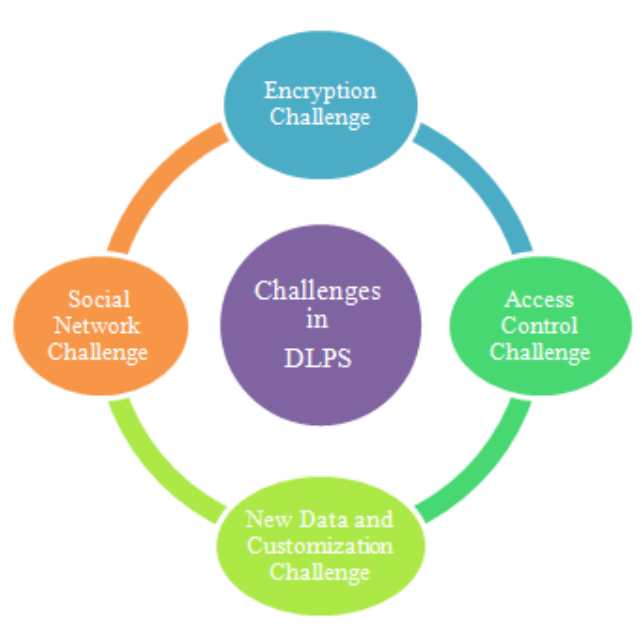
Figure 2. DLPS challenges

1. Encryption Challenge- encryption is only one approach to secure data and security also requires access control, data integrity, system availability and auditing. So, it is difficult to detect and intercept encrypted confidential data and to recognize the data leakage occurring over encrypted channels [9].