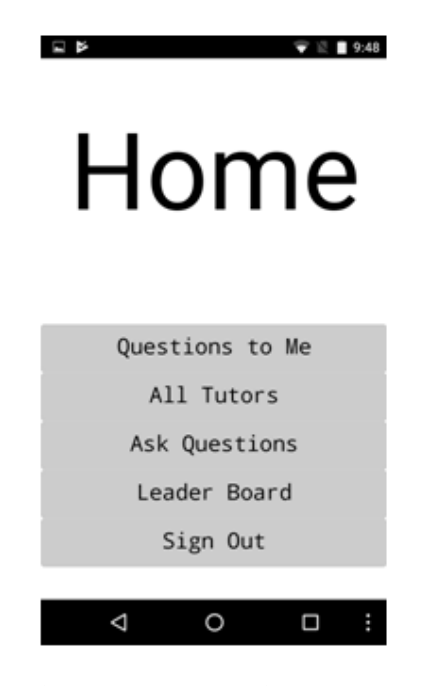
Figure 4. Home Page of Step Up App

One of the other factors to the fall of motivation in members of the Step Up club can mainly be attributed to the existence of the competition from the other organization of tutoring created at the school by the National Honor Society. The addition of the Step Up App helps diminish much of the lack of motivation in participating in Step Up because of the new feature that has been created that the competition lacks. It creates a new highlight that will draw members into because of its innovative aspect.