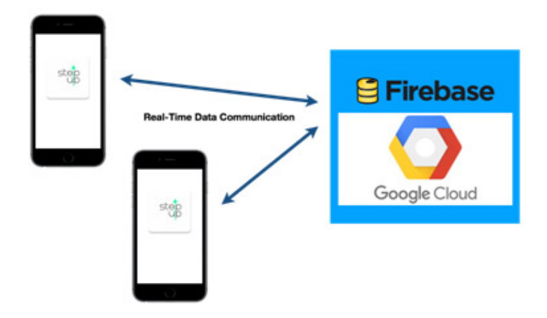
Figure 1. The Architecture of the Step Up App

Figure 1 shows an overview of the architecture of the app. The app is based on a typical serverclient communication model. We have implemented the app in Android, while the backend is supported by Google Firebase. The reason to choose Firebase is its enhanced support on real-time data communication and synchronization.